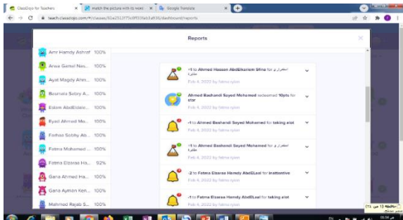
Figure (4) progress bar of class dojo